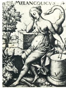
ALESSANDRA DAMLIA PESCETTA